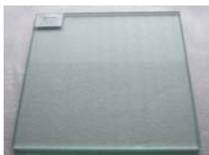
Clear float glass